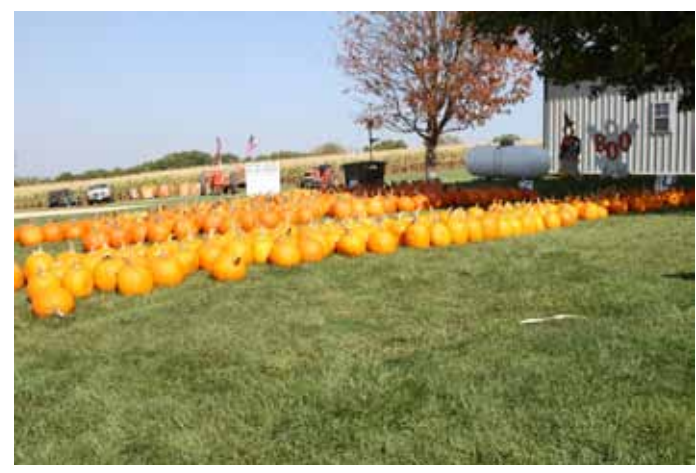
Lots of pumpkins to choose from, pumpkins priced by size.

Schuster's Pumpkin Patch & Corn Maze is open 10am to 5pm on Saturdays and Sundays only beginning September 21 thru October 27 this year. Free parking, free admittance and food options simply add to the attraction. If you want to learn more, check them out on Facebook, visit their website at www.schusterspumpkinpatch.com, or give them a call at 563-556-2879.