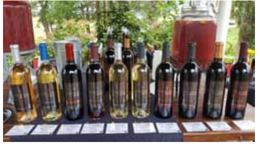
Wines offered at Glyn Mawr Winery-The Local.

The Local. Selling their wine, Iowa craft beer, Kombucha (a fermented tea produced in Iowa City) and various products and