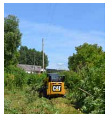
Clearing underbrush is equally important for efficient power restoral when power lines are on the ground.

To provide electric reliability and personal safety, it is important that crews working for Maquoketa Valley Electric Cooperative periodically trim trees and underbrush around power lines in your neighborhood. Tree limbs and power lines are a bad combination, especially with storms involving high winds, lightning or ice. Trees are one of the most common causes of electric service outages and