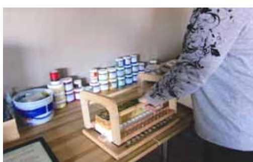
Lorna demonstrates how the cutter is used to make the bars of soap equal in size.

In answer to my obvious question and remembering my mom making handmade soap, Lorna replies, "Yes, lye is the chief ingredient needed to make soap. The types of oils and fats that are used make a difference in how hard or soft the soap ends up