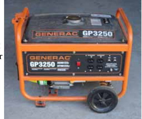
Portable generators are helpful in an extended power outage, but they can create serious safety hazards if not used correctly.

First rule of thumb? Never, ever use a generator indoors—even with windows open—or in an enclosed area, including an attached garage. Locate the generator where fumes cannot filter into your home through windows or doors—even 15 feet is too close. Carbon monoxide, which is odorless and invisible, can build up to lethal levels in a matter of minutes. If you plan to use a generator, install a carbon monoxide detector, and test the batteries monthly.