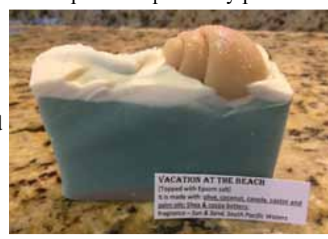
One of the varieties of soap the Lorna makes named Vacation at the Beach.

As we visited more, Lorna added, "Now I make 63